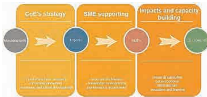
Figure 1. The Centre of Excellence Operational Framework

This model could be summarized with the following analytical framework, representing the above relationships (Figure 1).