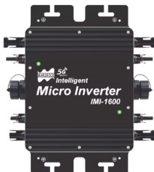
Figure 2. An overview of IMI-1600 hybrid solar inverter

It is capable to provide up to 1600 watts of energy required for heating / cooling a small office with a personal computer operating 24/7. It supports wireless communication to a 802.11 network as well as a mobile 5G modem for communication purposes.