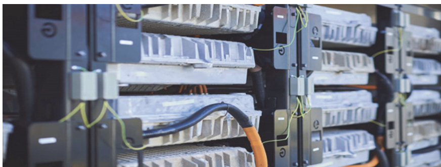
Figure 4. Renault Zoe battery pack