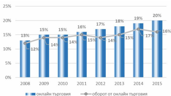
Figure 1. Online trading and realized working capital for the period 2008-2015 in the EU-28

According to the Eurostat data 8 in the EU- 28 for the period 2008 - 2015, the number of companies selling online increased by 7% and the reported growth in online trade was 4%. The share of online trade rises from 13% in 2008 to 20% in 2015, i.e. one in every five companies in the EU-28 is trading online. For the period considered, the turnover of online trade also recorded a relatively stable growth of 12% to 16%.